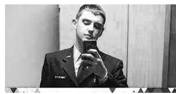
National guardsman Jack Teixeira arrested by the FBI

A federal magistrate judge ordered him held until a de-