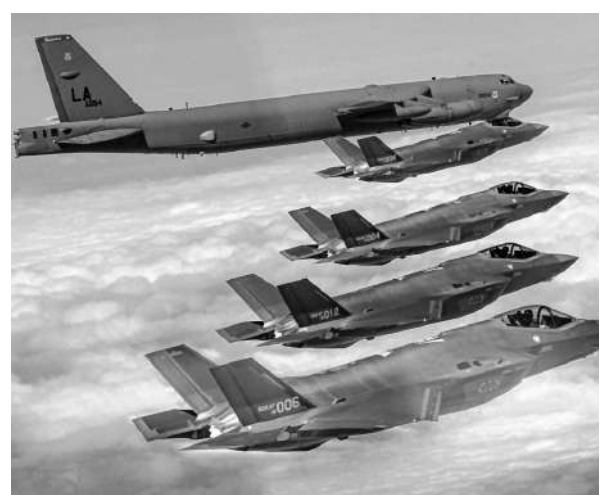
US Air Force B-52H strategic bomber (top) flying with South Korean Air Force F-35A fighter jets during a joint air drill in South Korea